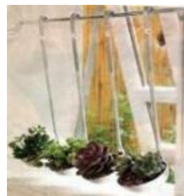
Another fab recycling idea – old ladles as plant holders!